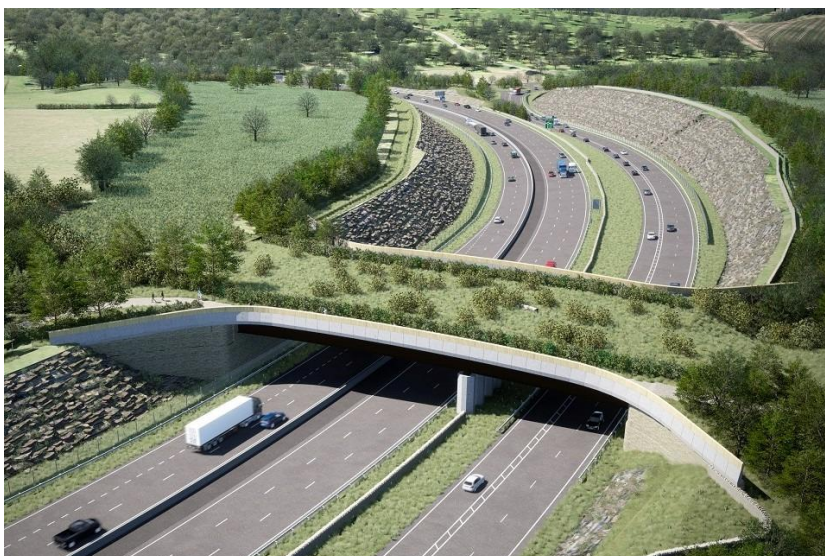
An artist's impression of the scheme shows plans for the Gloucestershire Way crossing

This landscape-led highways scheme will deliver a safe and resilient free-flowing road while conserving and enhancing the special character of the Cotswolds area. We are designing the scheme to fit sympathetically within the landscape, link habitats and support environmental sustainability.